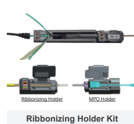
Ribbonizing Holder Kit

Discover the difference, Unlike any other!